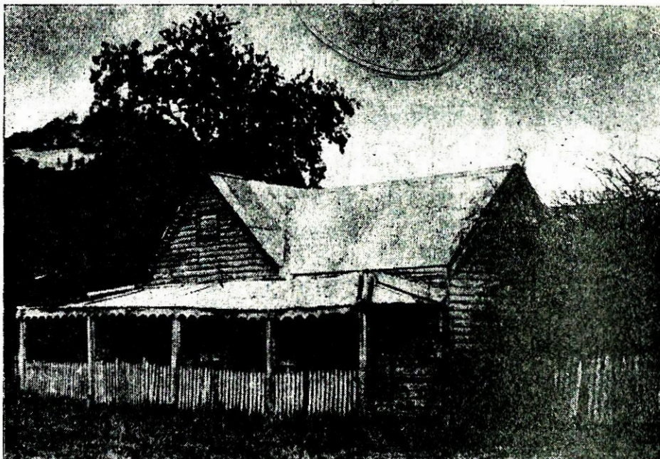
An old house at Dargo, Gippsland, and an hotel in the gold rush days.

I hope I haven't left anything out people, I'm signing off now, having used up all available space for this month. The printing and collating and editorial staff have lowered the boom on "bumper issues", and this is going to be big enough anyway. Cheerio.