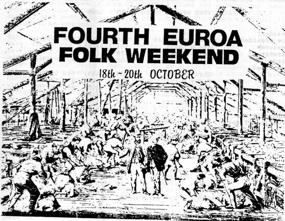
Shearing at the Yanko, New South Wales. (Illustrated Sydney News, 1869)