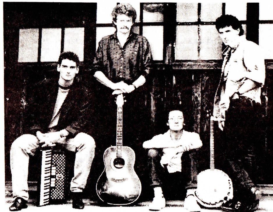
DINGLE SPIKE from Ireland