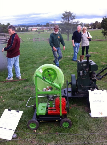
Some creative inventions of former years