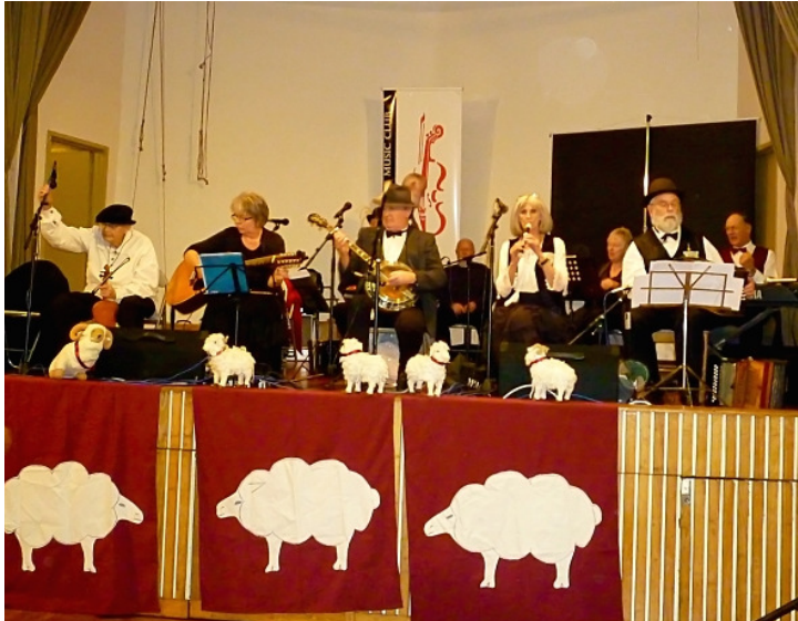
Emu Creek Bush Band at the Woolshed Ball 2014