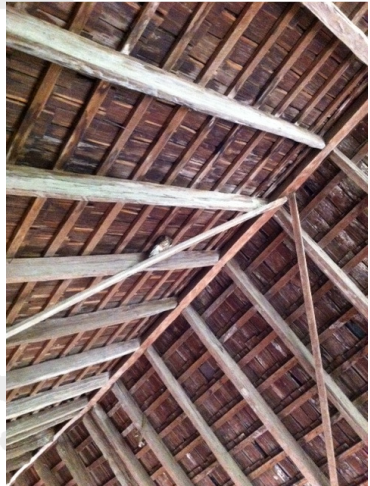
A sleeping barn owl up in the rafters of the tune-up barn (look very carefully)