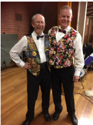
Two VFMC members in waistcoats