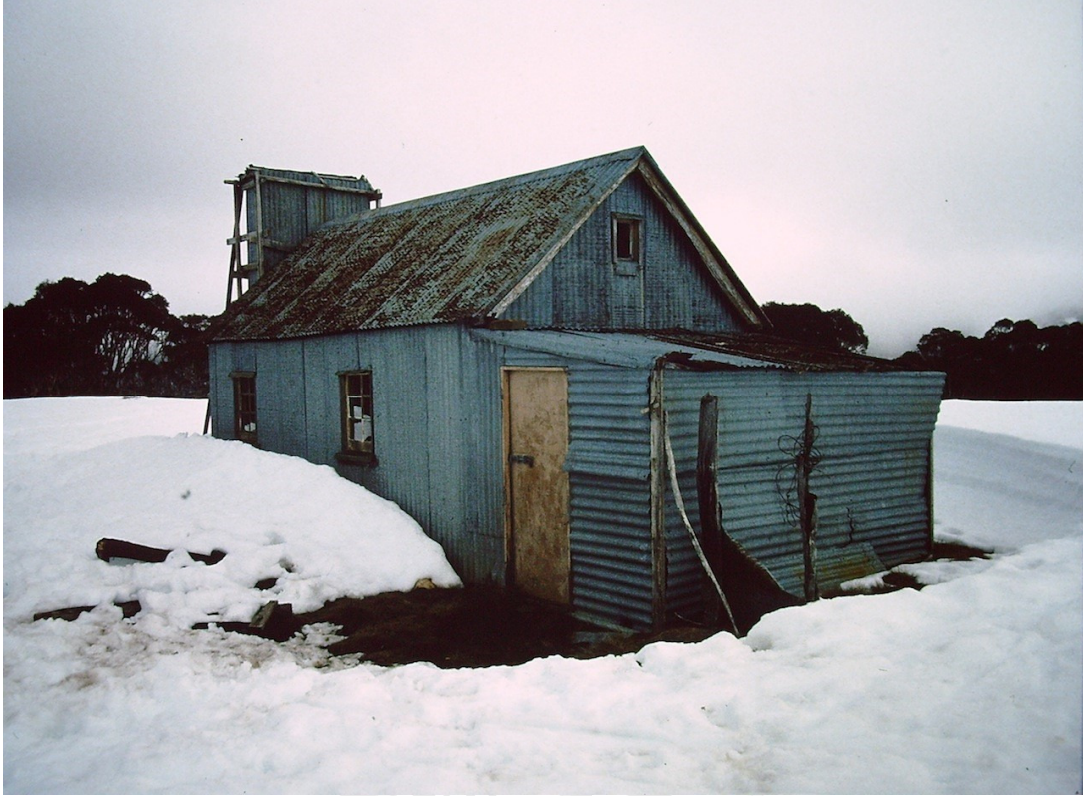
Spargo's Hut during the winter of 1987