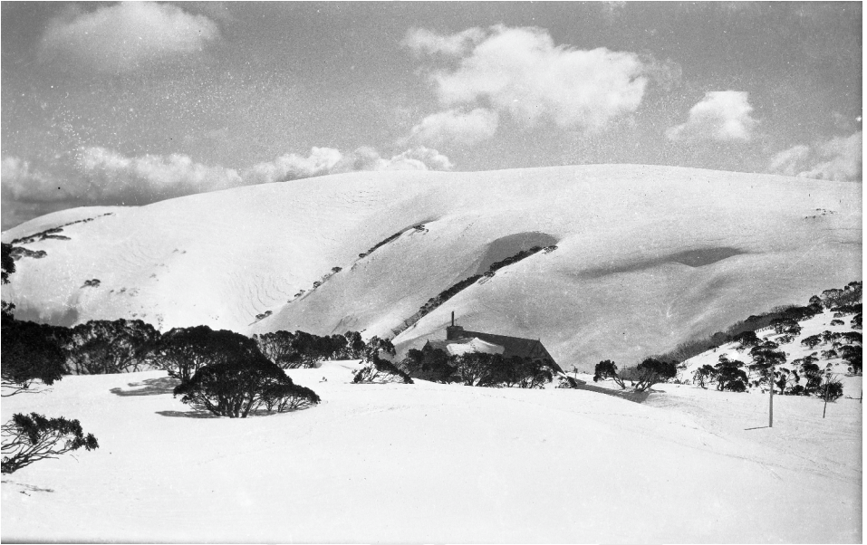
“Hotham Heights” chalet and Mt Hotham