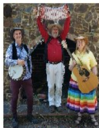
Live music with Blackberry Jam!